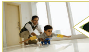
NATURAL SUNLIGHT & PROPER VENTILATION