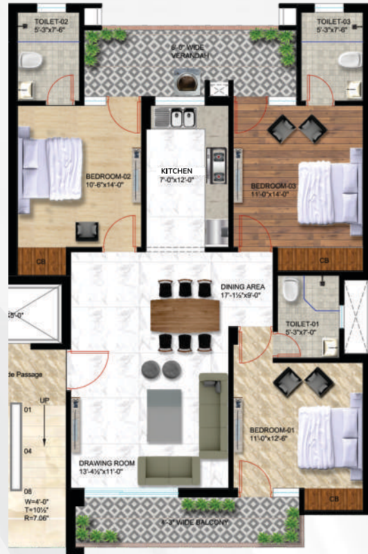
TYPICAL FLOOR AREA DETAILS