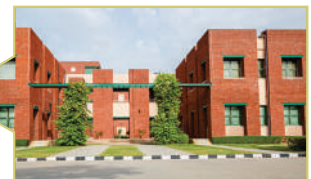
CONVENT SCHOOL IN FRONT OF APARTMENTS