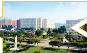
CHANDIGARH UNIVERSITY & COLLEGES NEARBY