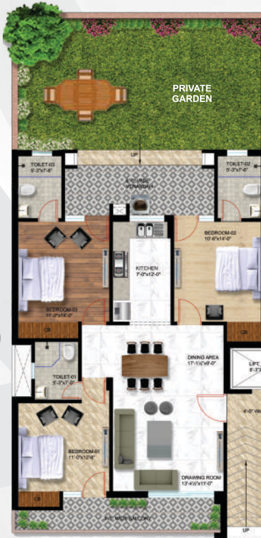
GROUND FLOOR AREA DETAILS