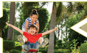
KIDS PLAY & SOCIAL INTERACTION AREA, JOGGING TRACK