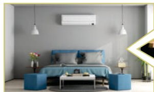
PROVISION FOR SPLIT AC WITH COPPER WIRE