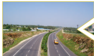
LOCATED ON NH-5 CHANDIGARH LUDHIANA HIGHWAY