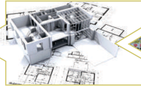
PHENOMENAL ARCHITECTURAL DESIGN WITH RCC STRUCTURE