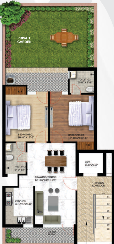
GROUND FLOOR AREA DETAILS