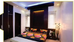
CUPBOARDS IN ALL BEDROOMS