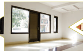
WOODEN DOORS & UPVC WINDOWS WITH TOUGHEN GLASS