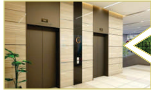
HIGH SPEED ELEVATORS